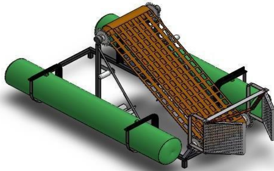
FIGURE 1. Assembled Design of the Machine